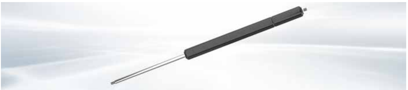
Length schematic: Standard and grease chamber configuration