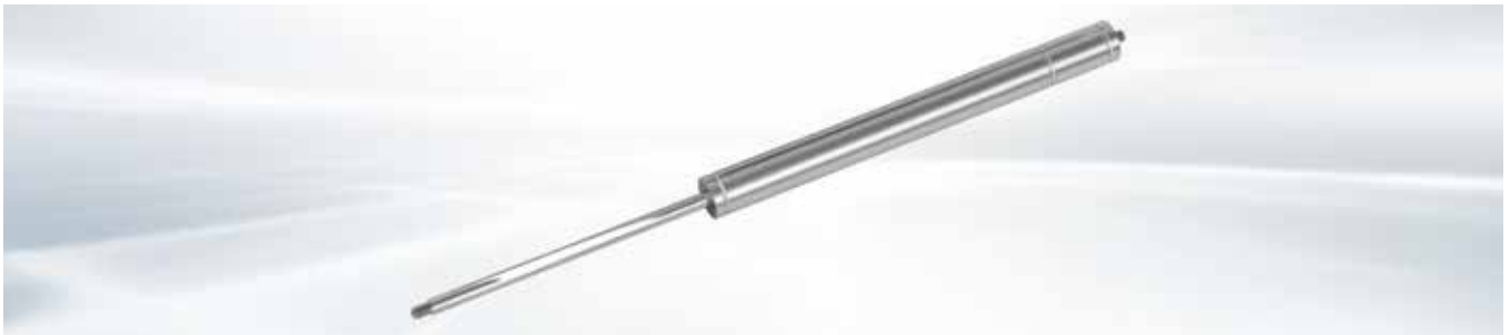
Length schematic: Standard and smooth-running configuration